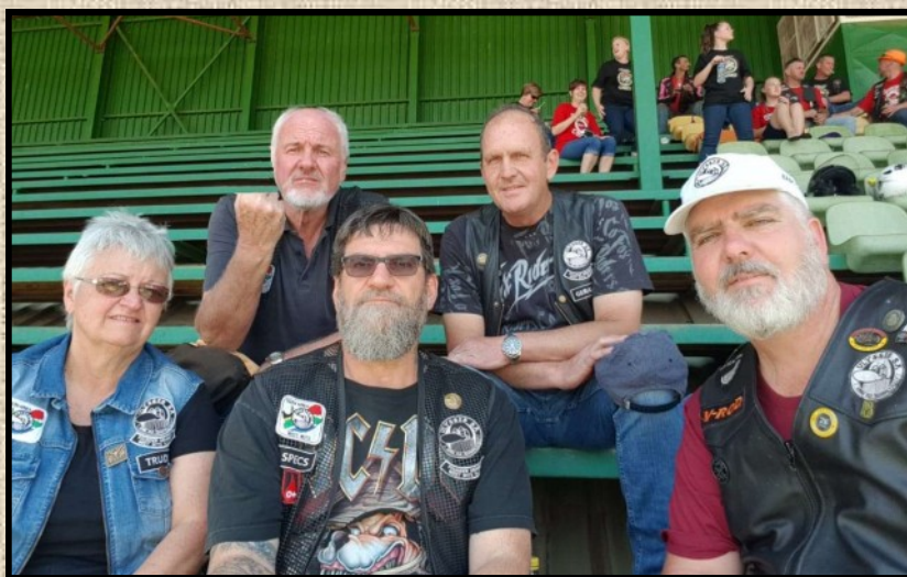
Photo Right: group sitting on the grandstands to get out of the direct scorching heat of the sun during the Heat Wave conditions.